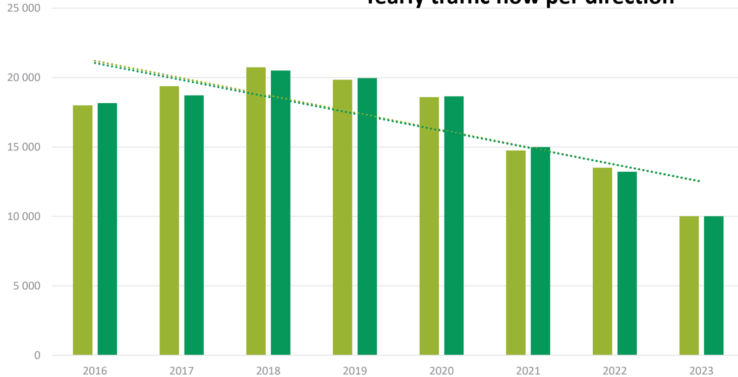
Yearly traffic flow per direction